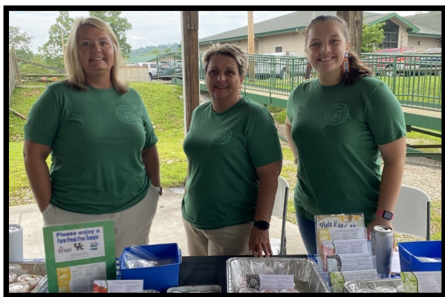
FCS Agent and NEP Senior Assistants