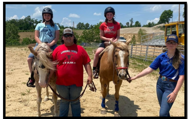
4-H Horse Camp

After participating in these hands-on clinics, it is seen that youth become more interested in participating in monthly club activities. A large percentage of non-club members that attend the workshops and clinics go on to join 4-H Horse Club. These events give 4-H members hands-on equine experience, leadership opportunities, and provide a safe learning environment for all youth interested in learning more about horses.